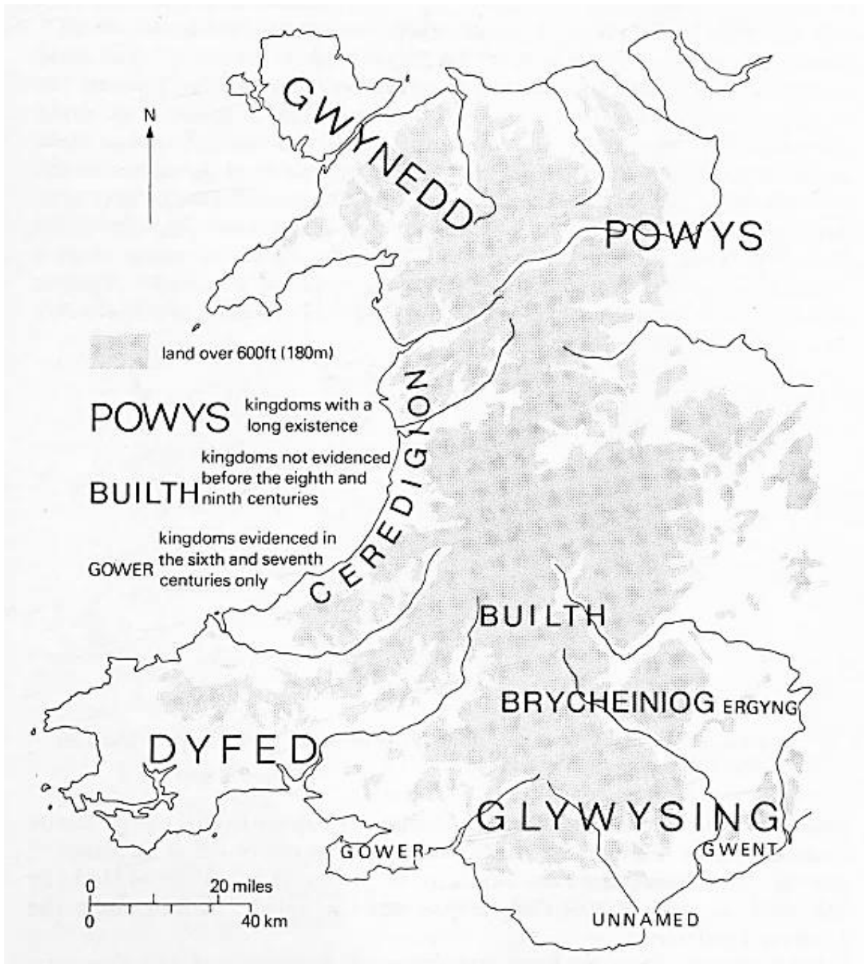
Figura 2 Early medieval Welsh kingdoms (W. Davies, Wales in the Early Middle Ages , 91).