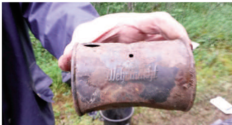
Fig. 4. A rusted can, likely part of a container for mosquito repellent, bearing the 'branding' of the German Wehrmacht , found in the forest around the outskirts of Inari.

to Finnish Lapland. Following a major Soviet assault in 1944 at the end of the Continuation War, Finland had no choice but to agree to a treaty with the Soviet Union, losing more territory and also pledging to expel the German military from its borders.