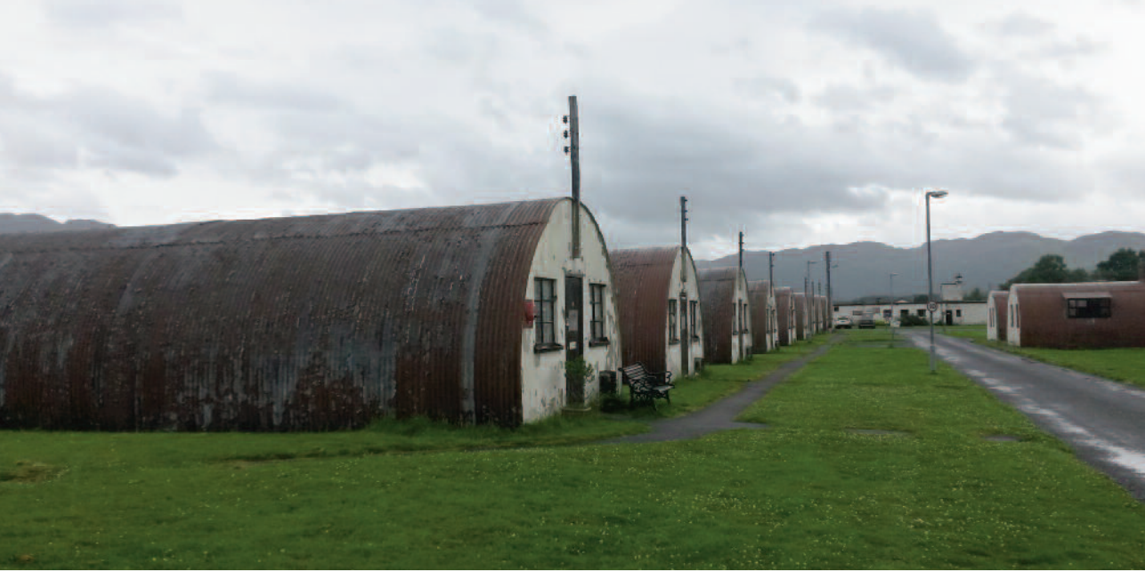
Fig. 7. Nissen huts that have survived from the Second World War period, at Cultybraggan camp.

Scottish context there has historically been a huge imbalance between private landownership and tenant communities. The opportunity to arrange community buy-outs is also connected closely to Scotland's 1997 devolution to have its own parliament, and has been heavily politicized as a result. This is because the question of land-ownership was one of the areas in which the newly-devolved Scottish government had authority and could affect change (see Thomas, Banks 2019, pp. 55-56 for a longer discussion of this). Purchases have included crofting land, and even former elite properties such as ruined castles. Among these purchases, Cultybraggan is unique so far in having a heritage connected so explicitly to WWII and to PoW incarceration in particular.