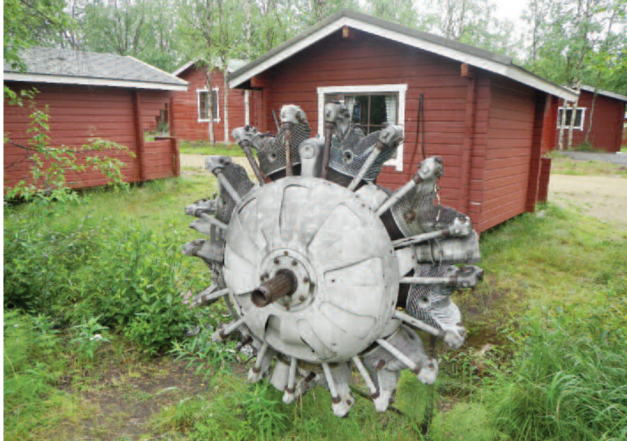
Fig. 5. Remains of an aeroplane engine from the Second World War, now experiencing a new purpose as a touristic feature mounted at a camp site in Inari.

material remnants from WWII might have 'value beyond their financial value as scrap metal' (Thomas et al. 2016, p. 339). Aside from this brief organizational interaction with the physical remains, we also found through our research that individual people also engaged with WWII material – for example developing personal collections of militaria, or repurposing larger objects as touristic features at camp sites (fig. 5) or other privately-run attractions. We also found that the popular semi-digital exploration pastime of geo-caching had taken advantage of several WWII sites in Finnish Lapland as exciting places for geo-cachers to explore.