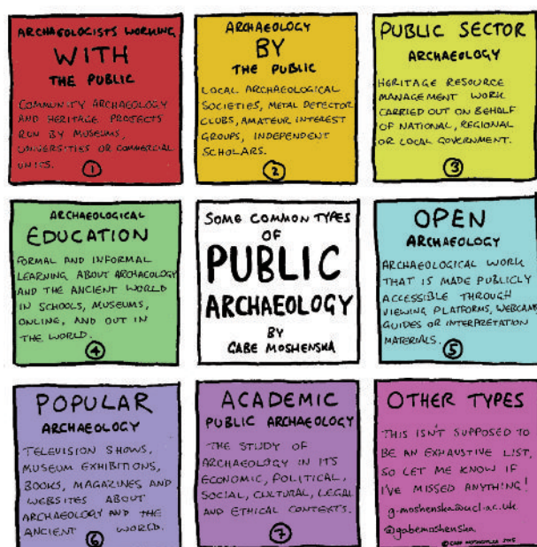
Fig. 1. Some common types of public archaeology as illustrated by Gabriel Moshenska. Reproduced with permission of Gabriel Moshenska. The diagram originally appeared in Moshenska 2017.

projects were able to integrate successfully participatory approaches, and I highlight some key ethical considerations that apply especially to sites connected with twentieth-century conflict.