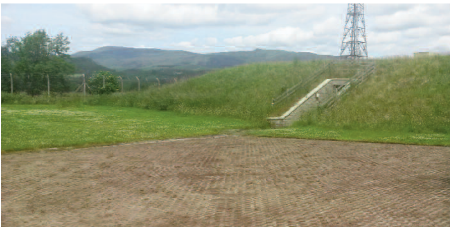
Fig. 6. The nuclear bunker at Cultybraggan camp.

In 2007, following local debate and a referendum over the previous two years, the village of Comrie elected to purchase the site as a community venture. In Scotland, this is a fairly common process that many communities have enacted for local purchase through the Land Reform (Scotland) Act 2003, and the later 2016 revision of that law. As others have discussed at length (e.g. Chevenix-Trench, Philip 2001), in the