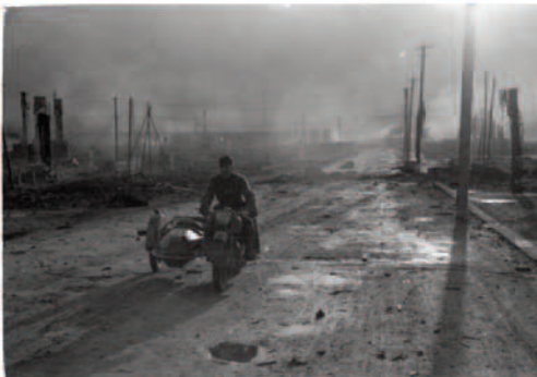
Fig. 3. A motorcyclist drives down Valtakatu (En: “Power Street”), Rovaniemi, in October 1944 following significant damage to the city as part of the Lapland War.

The northern front in Finland soon became stationary however, as the German troops quickly found themselves poorly prepared for the Arctic Tundra conditions. This did mean that during the ‘German period’ in Finnish Lapland there were other activities such as development of roads and other infrastructure. Close friendships – including romantic relationships – developed between the Germans and local Finns and Sámi (Koskinen-Koivisto 2016). In addition to the German soldiers, the conflict also brought Prisoners of War (PoWs), and labourers from Organisation Todt